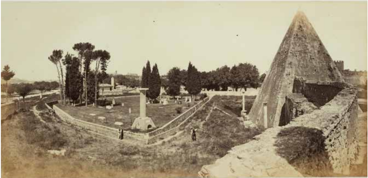
Fig. 2. Robert Macpherson, View of the Pyramid of Gaius Cestius and the Old Cemetery , c. 1864 (McGuigan Collection). Note the walled moat with the Bowles monument centre foreground, and the staircase down to the Pyramid entrance.

would have been the three monuments that are known to have been standing at that date, namely those of Werpup, Macdonald, and Stevens (see Table 1 ). The lack of earlier evidence for stone memorials and de Sade's surprise in 1775 at seeing three of them render it unlikely that others had been erected in the period 1716–1765 and have subsequently been destroyed.