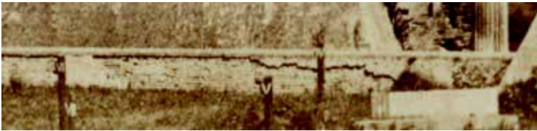
Fig. 5. Detail of Fig. 4 showing wooden posts IV, V, VI, and VII.

on Fohr's grave is dated 24 December 1819 and it is possible that he had not yet installed it when Trucchi made a record of earth-graves that included Fohr's in its original state with a post. The remains of John Deare (see Table 3 ), buried long before Trucchi's employment, must have been identified either from evidence found with the bones or by a witness to his place of burial.