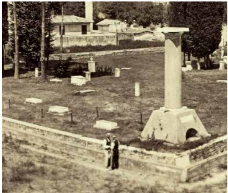
Fig. 3. Detail of Fig. 2 showing alignment of three ledgers and five wooden posts.

A third photograph (also attributed to James Anderson, c. 1860, unpublished, McGuigan Collection) shows another